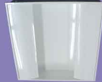
Side mounted reflector