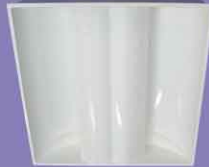
Center mounted reflector