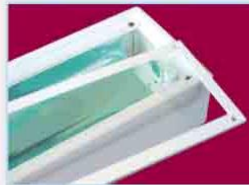
Tempered proof clear lens