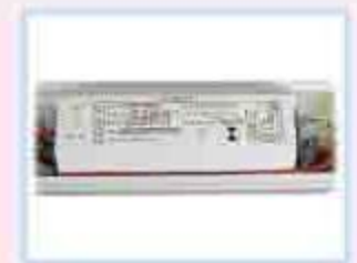
Emergency Power Pack