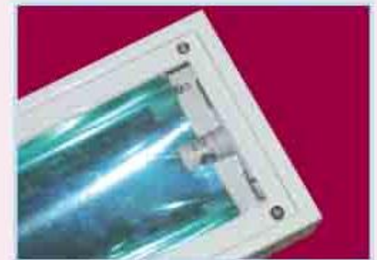
Specials TORX head screw