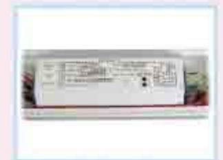
Emergency Power Pack